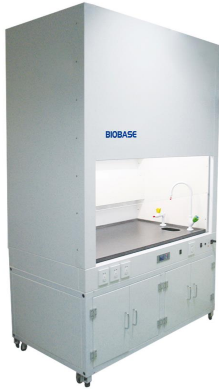
FH1500 Fume Hood