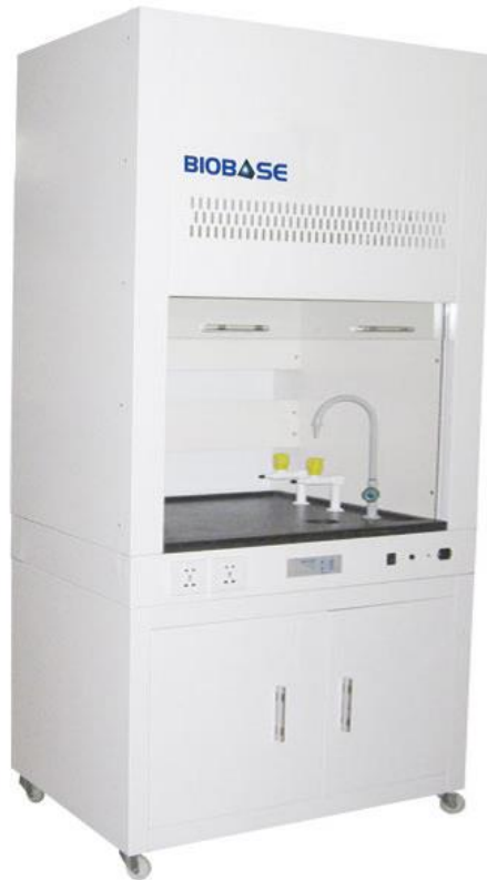
FH1200 Fume Hood